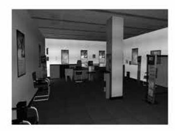
c. Bank office environment